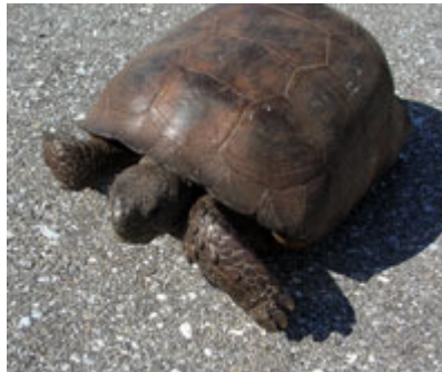
This Florida Gopher Tortoise ( gopher polyphemus ) is a regular parking lot visitor in Turtle Crossing and has his burrow just off Doredo Drive.

If it's a gopher tortoise, absolutely not. Florida law states "No person shall buy, sell, take or possess any gopher tortoise, or any part thereof, except by permit from the FWC executive director." Moving a tortoise could constitute temporary possession.