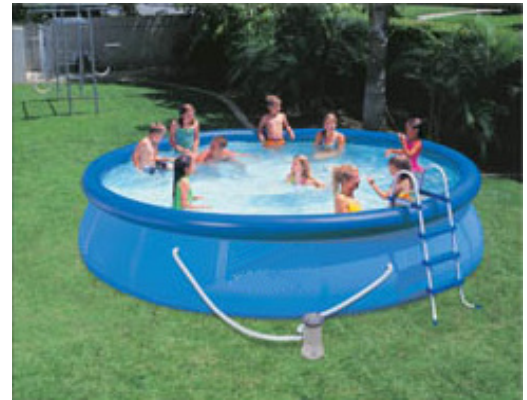
Residents who have above-ground pools are requested to permanently remove the pools.

Residents are requested to remove their pools effective immediately. ■